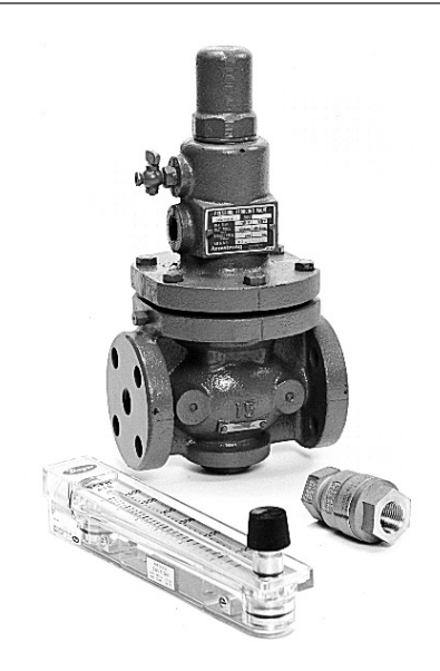
Posi-Pressure Control System Suggested Installation